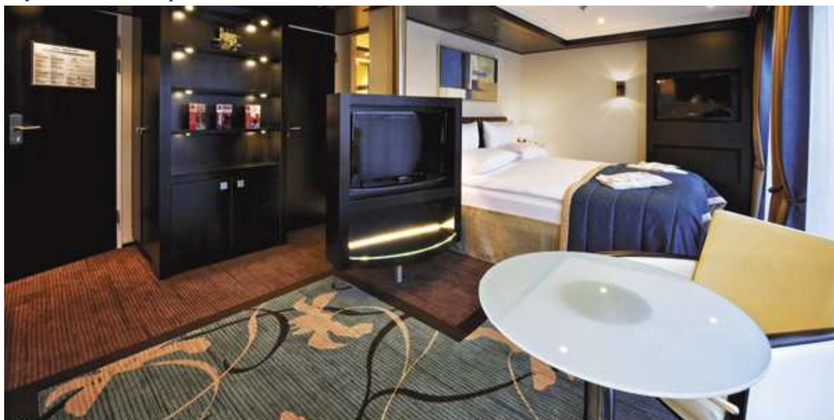
PHOTO SHOWN IS REPRESENTATIVE OF A STATEROOM IN THE CATEGORY