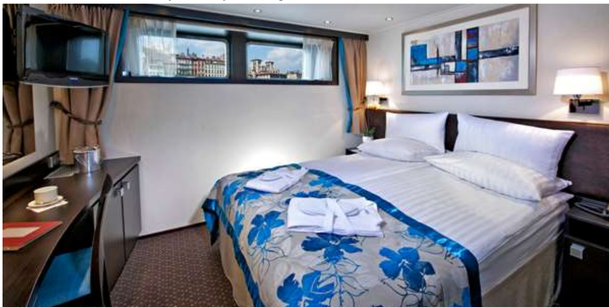
PHOTO SHOWN IS REPRESENTATIVE OF A STATEROOM IN THE CATEGORY

Avalon Deluxe Stateroom (Cat. D, E) - 172 sq. ft.