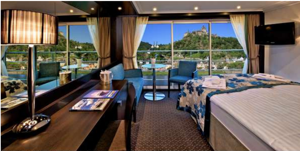
PHOTO SHOWN IS REPRESENTATIVE OF A STATEROOM IN THE CATEGORY

Panorama Suite (Cat. A, B, P) - 200 sq. ft.