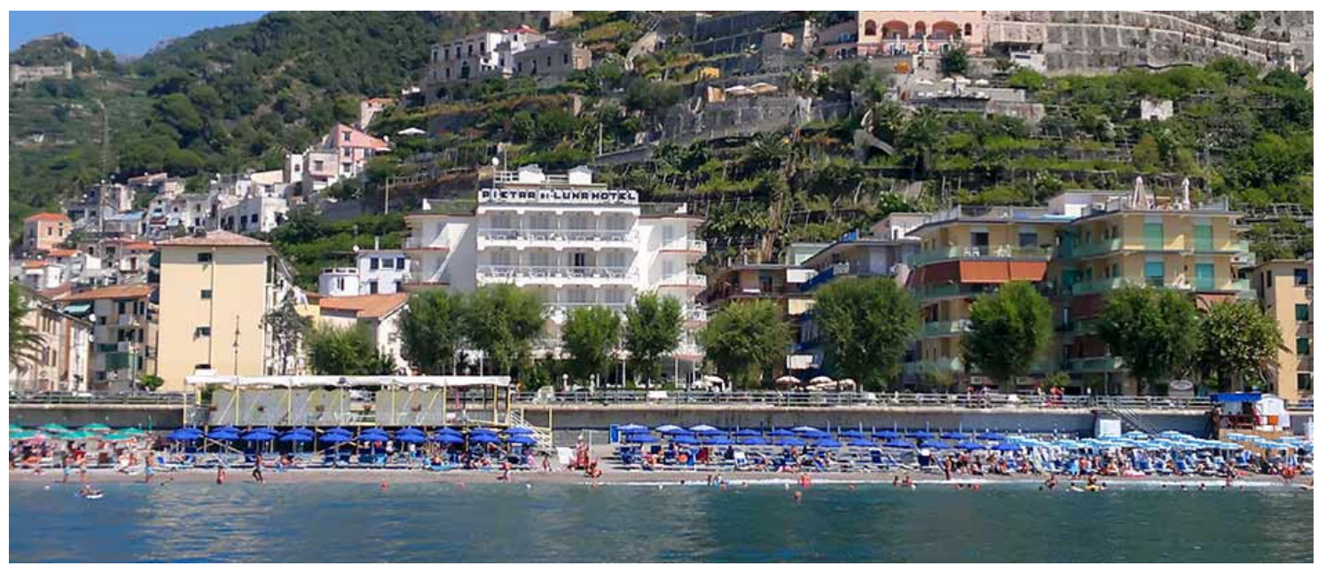
Hotel Pietra di Luna