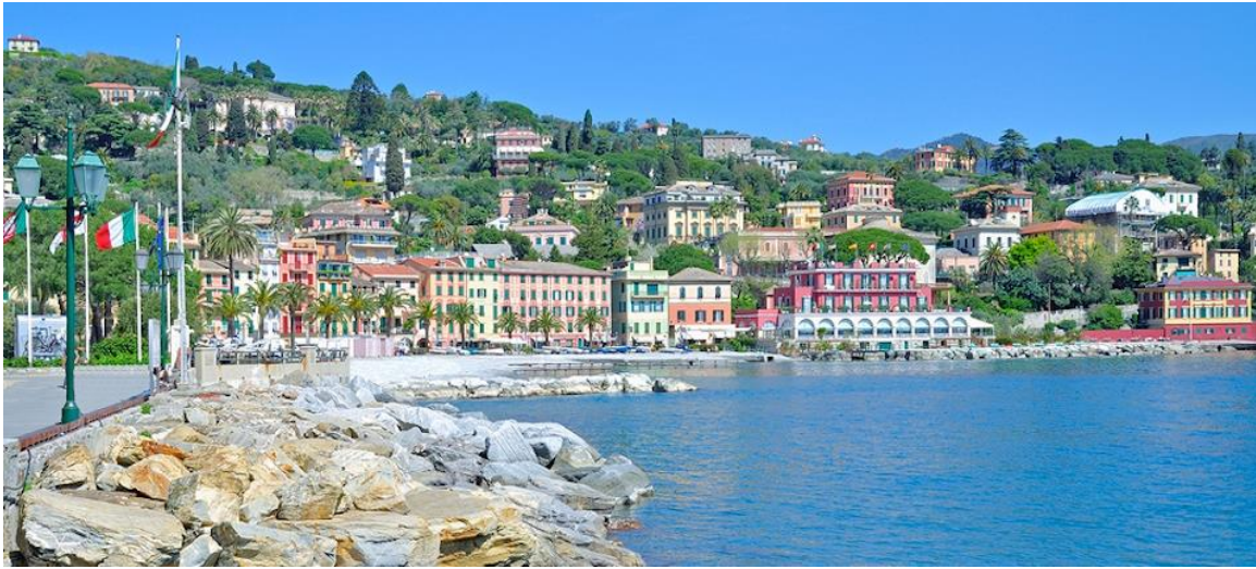
Santa Margherita Ligure

Today we'll enjoy a full-day excursion that begins with a drive to Santa Margherita Ligure where we board the boat for a short cruise to Portofino—a picturesque, half-moon shaped seaside village with pastel houses lining the shore of the harbor. Enjoy free time in Portofino before returning to the hotel in the late afternoon. This evening enjoy dinner with wine at the hotel. (B,D)