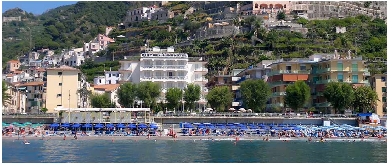
Hotel Pietra di Luna