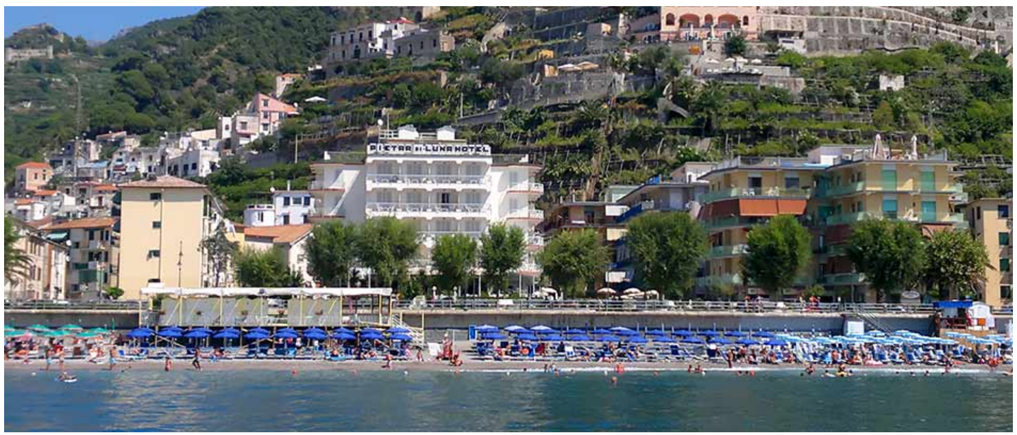
Hotel Pietra di Luna