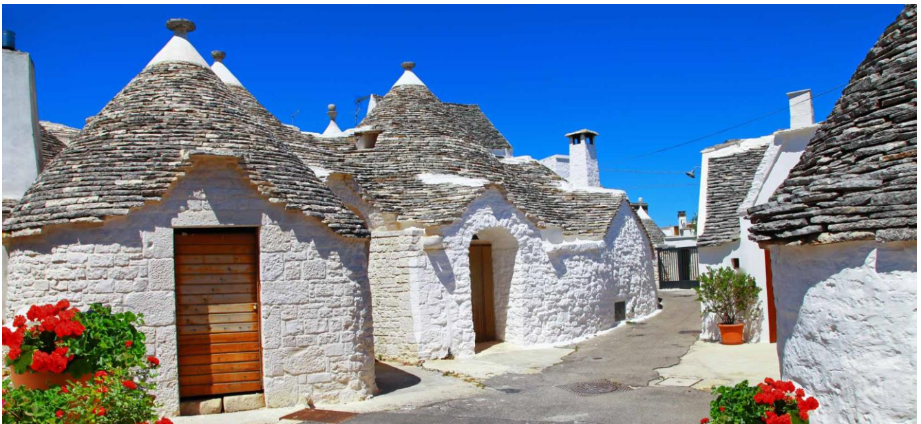
Trulli of Alberobello

After breakfast we'll depart the hotel for an excursion to Alberobello. Here we'll see the famous Trulli of Alberobello, picturesque cone shaped houses that take you back in time to a traditional countryside lifestyle. Needless to say, Alberobello is a UNESCO world heritage site. We'll have time to browse the Alberobello Market. Next, we'll transfer to the Masseria Brancati for lunch, including wine of the estate. In the afternoon we'll continue on with a guided tour of Ostuni. Resting on three hills, Ostuni offers the visitor a fairytale vision of shining whitewashed buildings standing out against the clear blue sky. Dinner with wine at hotel restaurant. (B,L,D)