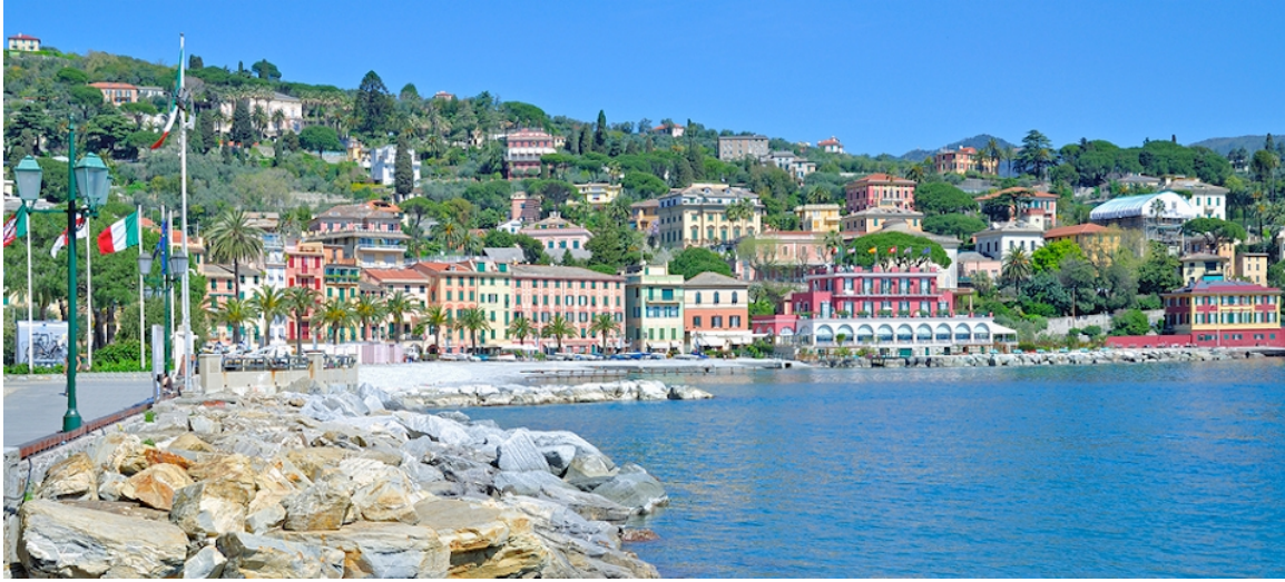
Santa Margherita Ligure

Today we'll enjoy a full-day excursion that begins with a drive to Santa Margherita Ligure where we board the boat for a short cruise to Portofino—a picturesque, half-moon shaped seaside village with pastel houses lining the shore of the harbor. Enjoy free time in Portofino before returning to the hotel in the late afternoon. This evening enjoy dinner with wine at the hotel. (B,D)