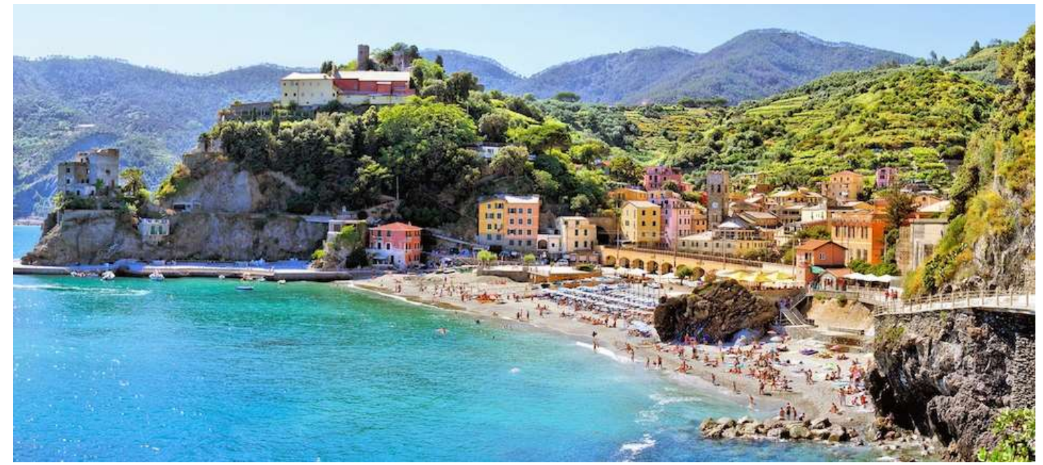
Monterosso al Mare