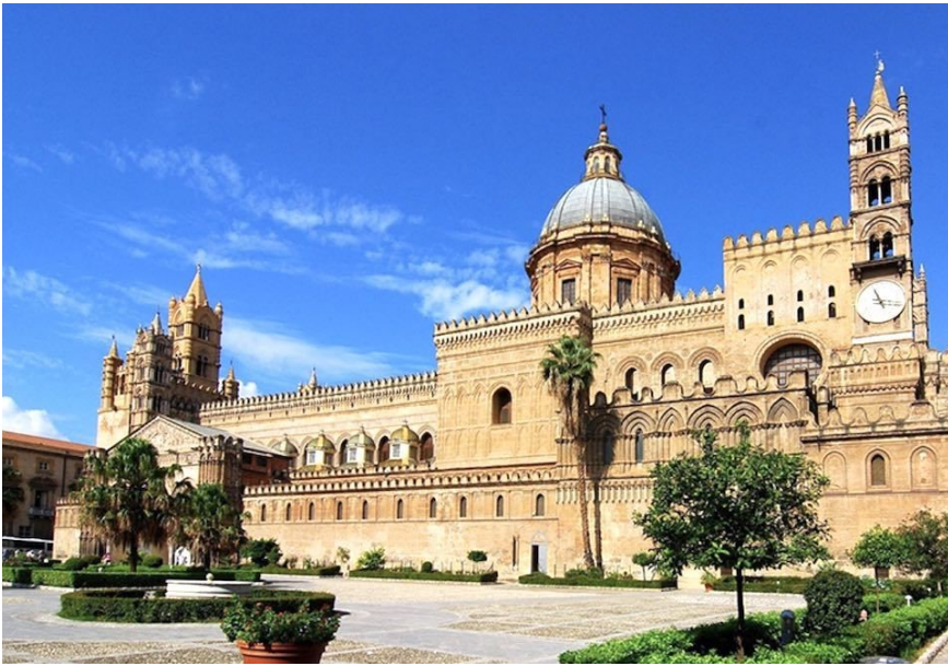
The Norman Palace