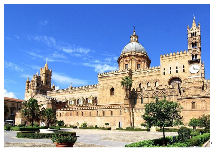
The Norman Palace