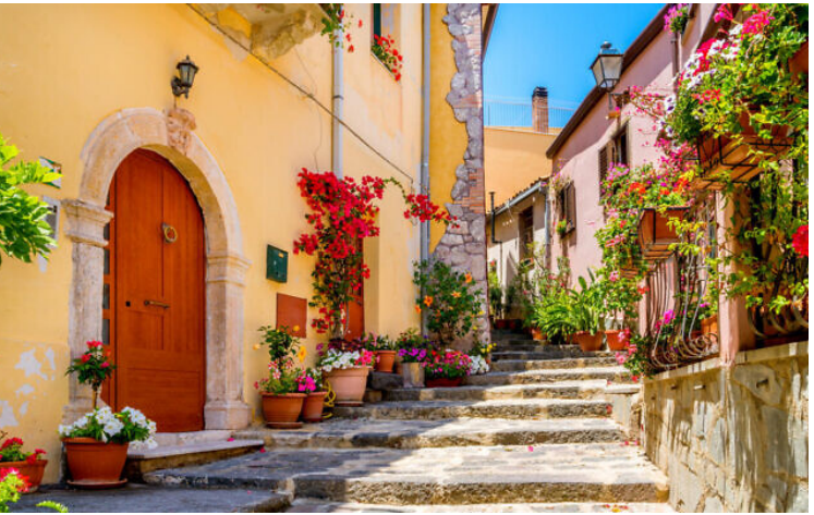
Day 9: Return to Boston

Transfer to Catania airport and board your flight to Rome. Upon arrival proceed to your international flight to Boston.