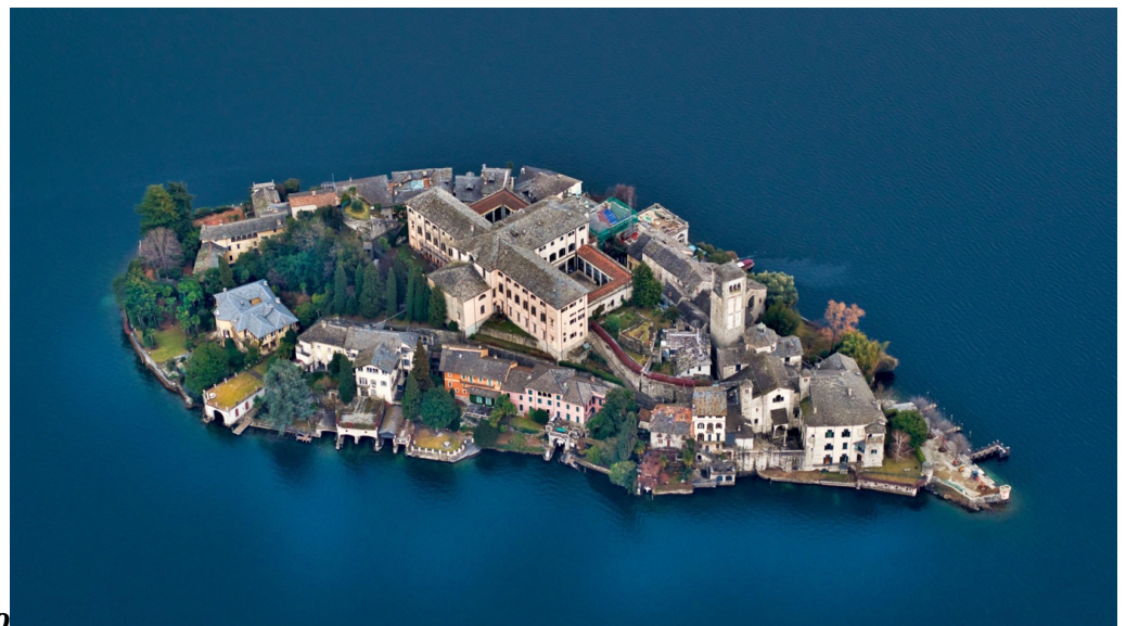
Orta San Giulio