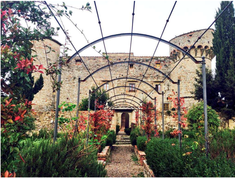
Castello di Meloto