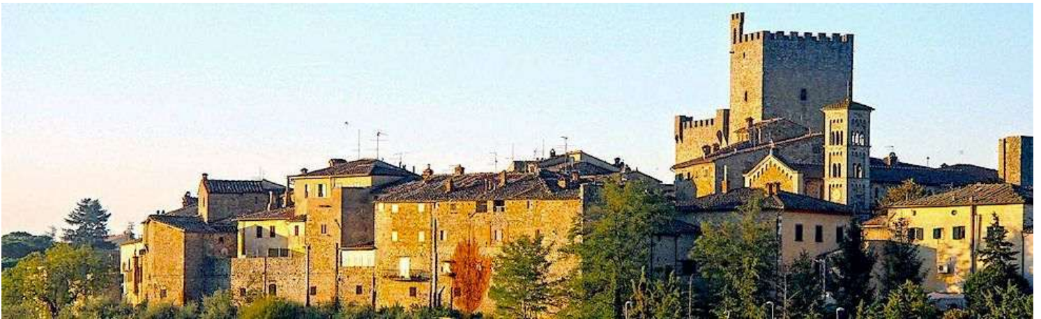
Castellina in Chianti